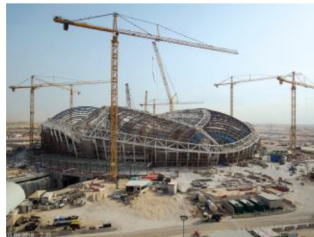
2016 - 2018: Al Wakrah Stadion, Katar