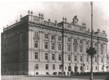
1907 - 1909: House of Industry, Vienna