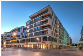
2014 - 2016: Prager Carree, Dresden