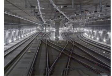
2001 - 2005: Lehrter Train Station, Berlin