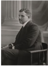
Arthur Porr Copyright: © PORR