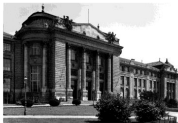
1909 - 1913: Technical Museum, Vienna