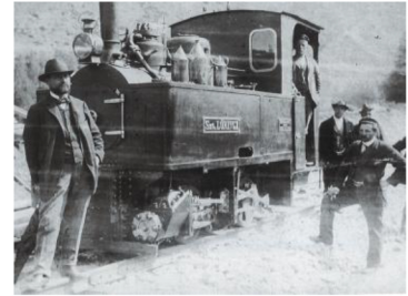
1904 - 1906: Construction of the Vinschgaubahn, Meran-Mals, South Tyrol