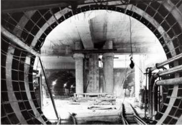
1972 - 1978: Metro, Vienna