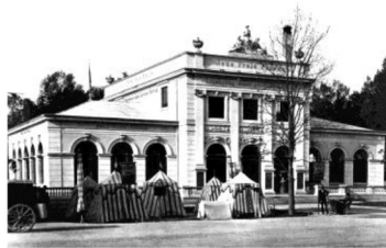
1873: Pavillon New Free Press Vienna World Exhibition, Vienna