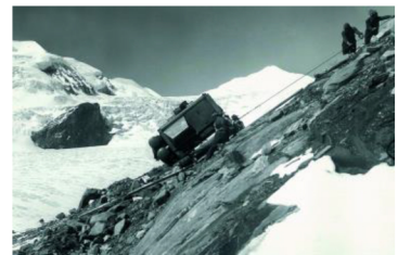
1930: Grossglockner High Alpine Road, Austria