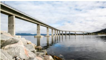
2015 - 2018: Tresfjord-Bridge, Norwegen