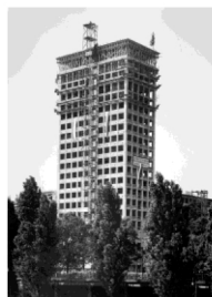
1955: Ringturm at Danube Canal, Vienna