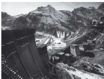
1951 - 1955: Tauern Power Station Glockner- Kaprun, Drossen Barrier, Mooser Barrier (Kaprun Upper Stage Barriers)