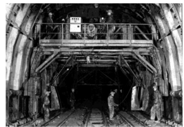
1963- 1967: Felbertauerntunnel, Austria