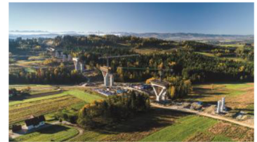
2017 - 2019: Expressway S7, Polen